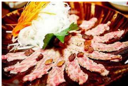
Kobe Beef Tataki: Tender meat that does not disappoint.

Another refreshing appetizer was the Ikura Kyuri Cheese, which was Japanese Cucumber with a mixture of Salmon Roe, Camembert Cheese and Olive Oil.